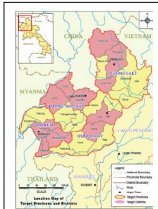
Project Site of NRIDSP

NRIDSP is implemented by the Department of Planning (DOP) under the Ministry of Agriculture and Forestry (MAF), financially assisted by the Asian Development Bank (ADB) (ADB Grant No. 0235-Lao SF) commencing from August 2011. The key project objectives are to increase rural productivity and subsequently rural incomes in the northern region which covers 4 provinces consisting of Oudomxai, Bokeo, Luang Namtha and Pongsaly Provinces.