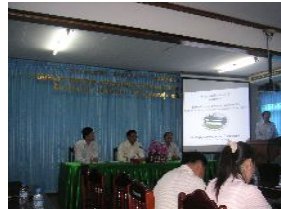
Opening Remarks by Director of PAFO in Bokeo Province (October 24 th 2011)

The workshop commenced from opening speech by the director of PAFO (Bokeo and Luang Namtha Provinces respectively) followed by the presentation of general information about the Project and technical explanation from each subsector as shown in the following table.