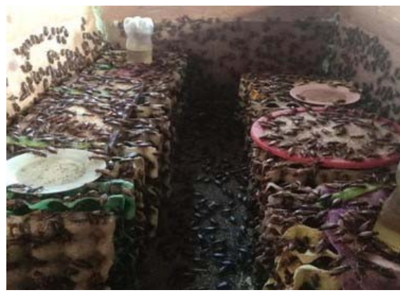
Cricket raising, Nam Ma Subproject, LNT. Dec. 2021