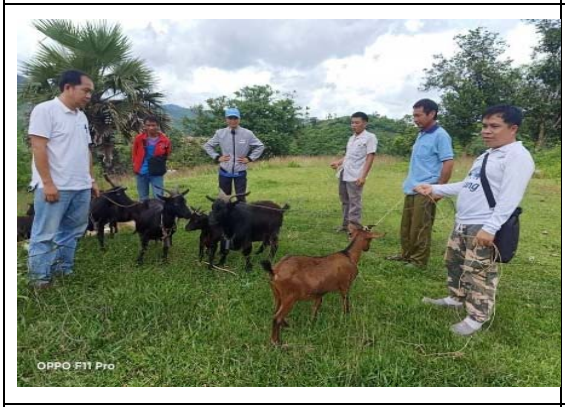
Field visit to Chavang village of Akha tribe to review progress of FFES activity (Bountai, PSL, 9 Sep 2021).